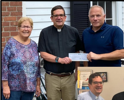
Southington Community Services (above)