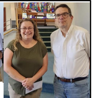
The Cove for Grieving Children (above)