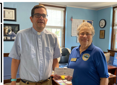
Southington Veterans' Committee