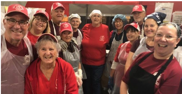
The Fritter Booth