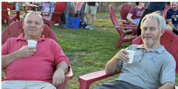
Long View Cider House!