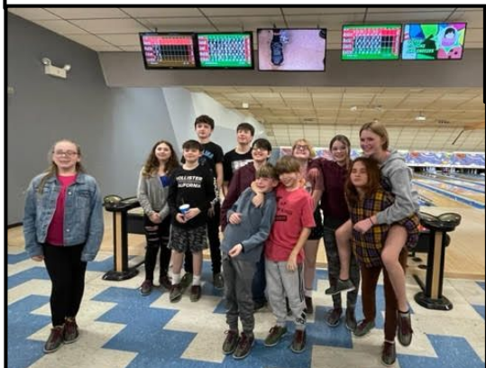
Bowling on March 25 th (left)

Meetings are held on Sundays from 7:00-8:15PM.